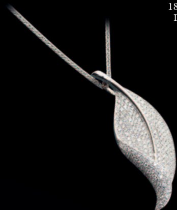
18ct Diamond Leaf Pendant £2585