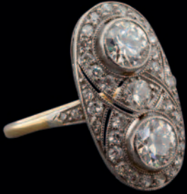
Platinum 1920's Ring £POA