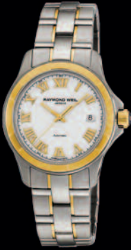
Raymond Weil 18ct Gold & Steel Automatic Parsifal £2325