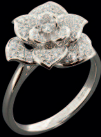
18ct Diamond Flower Ring £1790