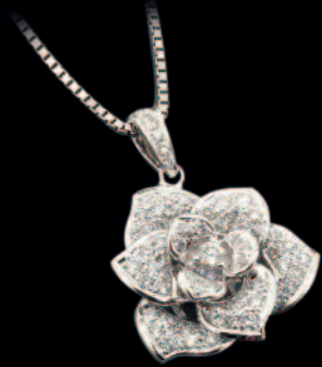
18ct Diamond Flower Pendant £1650