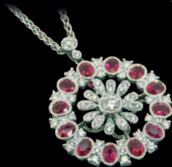
18ct Ruby Diamond Pendant £5985