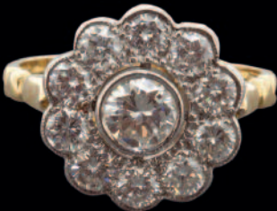
18ct Yellow & White Gold Diamond Cluster Ring £3390