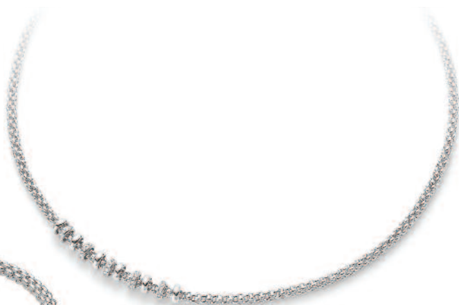
18ct Diamond Necklace £4690