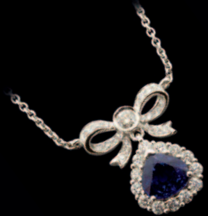
18ct Sapphire & Diamond Pendant £5965