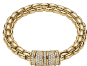
18ct Diamond Flex-it Bracelet £4590