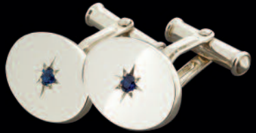
Sterling Silver & Sapphire Cufflinks £240