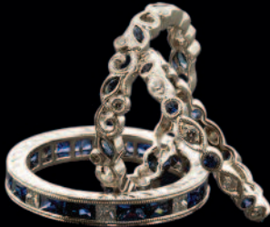
Sapphire & Diamond Eternity Rings Design by Ungar & Ungar From £1100