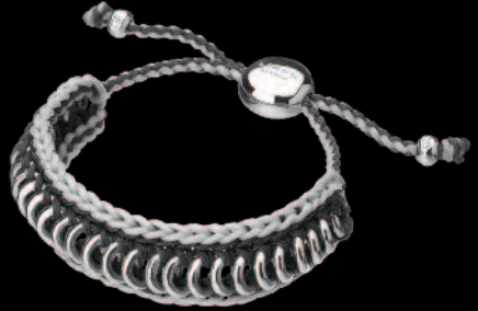
Link of London Woven Sweetie Bracelet £175