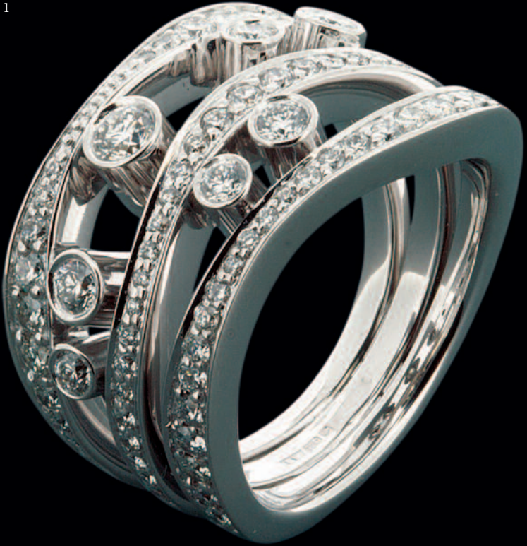
18ct Diamond Cluster Ring Design by Leo Wittwer £4950