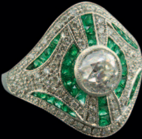
18ct Deco Style Emerald & Diamond Ring £6695