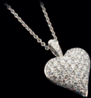
18ct Diamond Pave Heart Pendant £2585