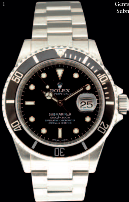
Gents Rolex Submariner £4650