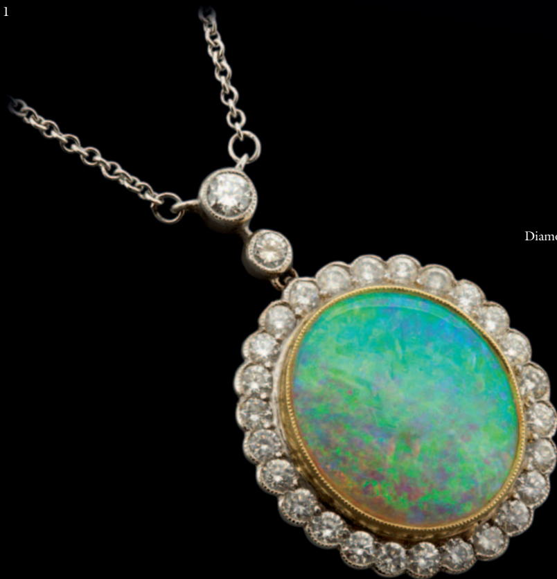
18ct Opal & Diamond Pendant £6250