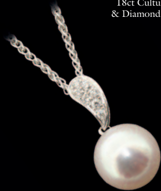
18ct Cultured Pearl & Diamond Pendant £675