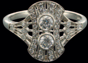
Platinum Deco Style Diamond Ring £2300