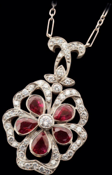
18ct Ruby Diamond Deco Style Pendant £5960