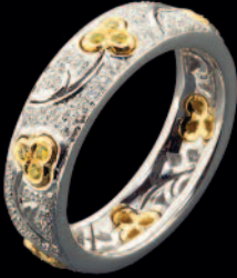
18ct Yellow Diamond Ring Design by Ungar & Ungar £2150