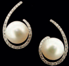
18ct Freshwater Pearl & Diamond Earrings £2435