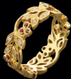
Ruby & Diamond Ring Design by Ungar & Ungar £1895