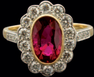
18ct Yellow & White Gold Rubelite Diamond Cluster Ring £2485