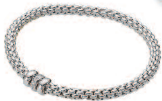
18ct Flex-it Bracelet £2280