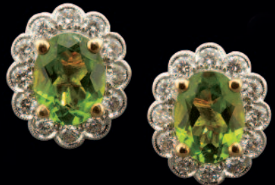
18ct Diamond & Peridot Cluster Earrings £2115