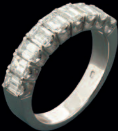
18ct Emerald Cut Eternity Ring £4885