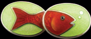
Sterling Silver & Enamel Fish Cufflinks £140