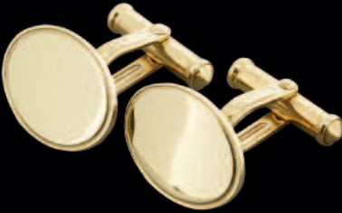
9ct Swivel Bar Cufflinks £750