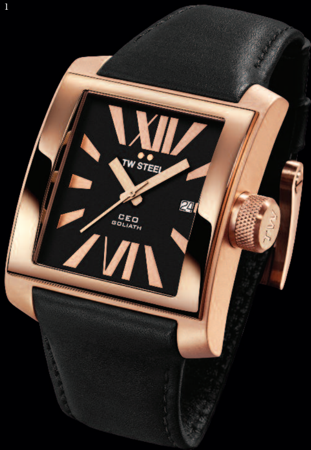
TW Steel CEO Goliath £355