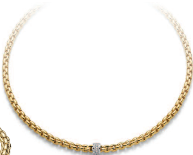
18ct Flex-it Necklace £6575